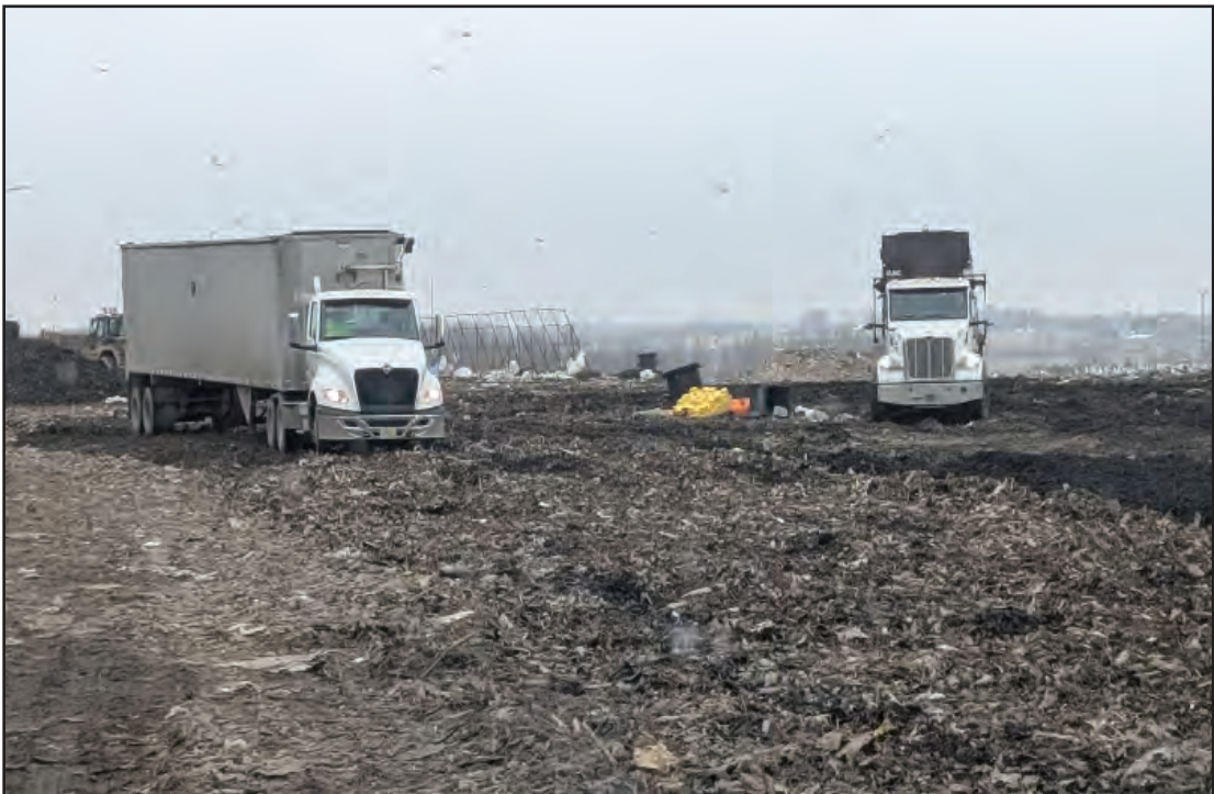
Truck backing up to tip and other truck cleaning out