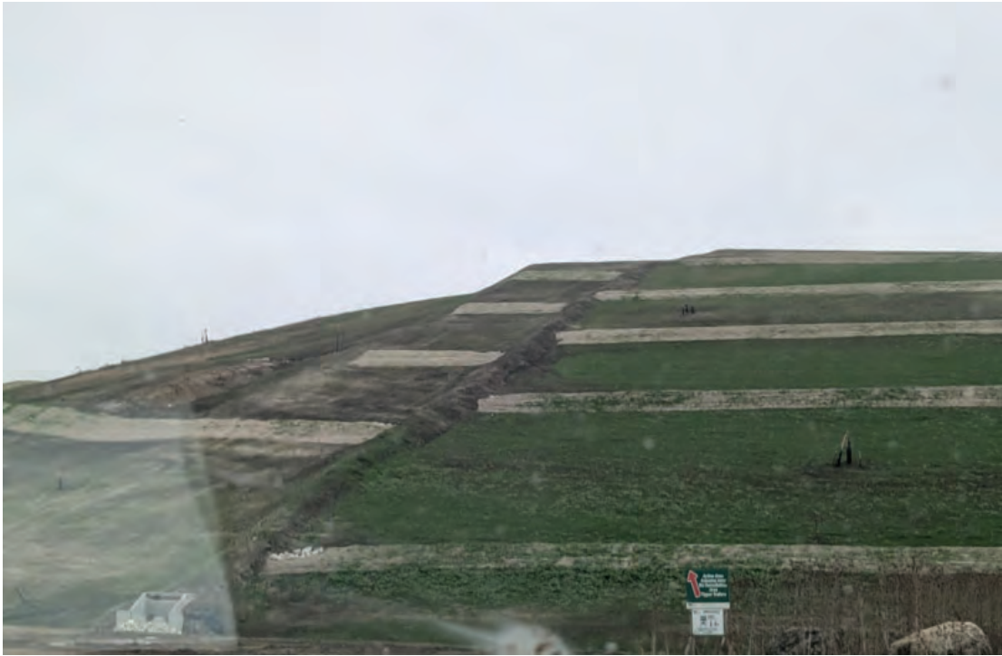
West slope of cap project, vegetation is developing quickly