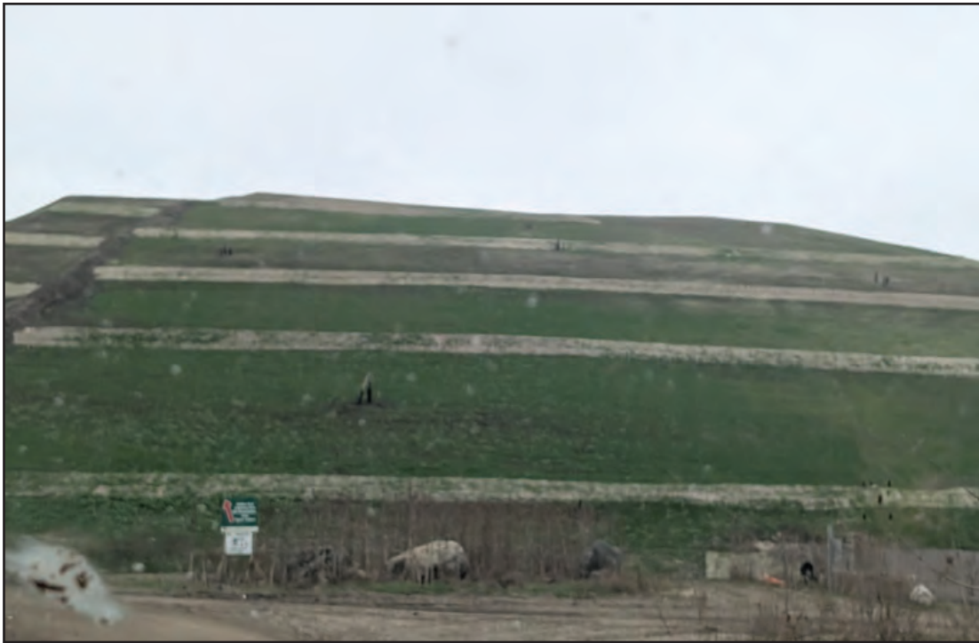
West slope of cap project, vegetation is developing quickly