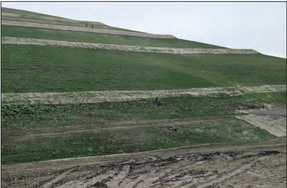
West slope of cap project, vegetation is developing quickly