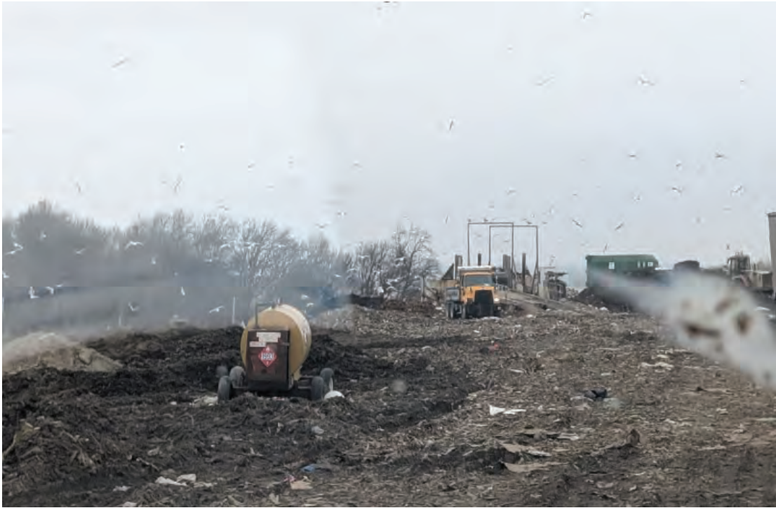
Dump truck tipping street sweepings, used to improve travelway