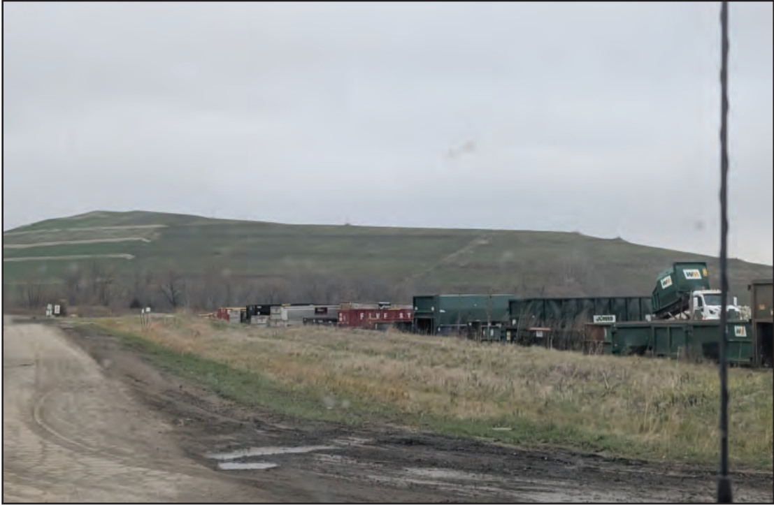
West slope of cap project, vegetation is developing quickly