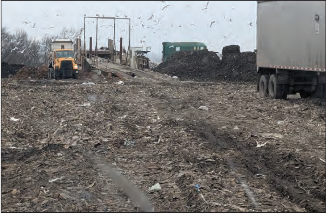
Tipper with stockpiling on either side