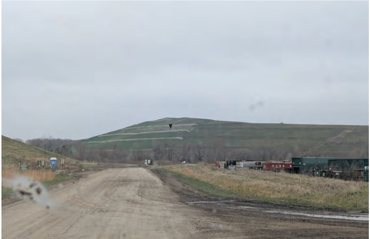
West slope of cap project, vegetation is developing quickly