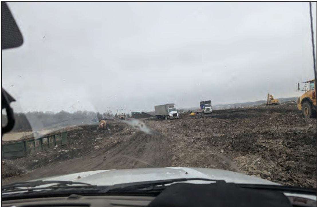
Active area in Phase 4